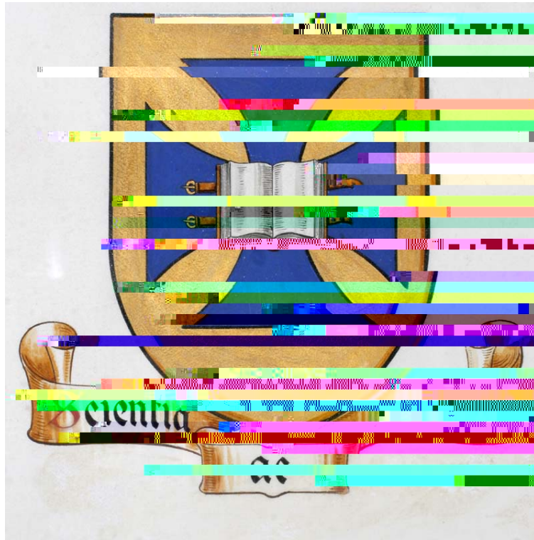
The original coat of arms as granted by the Herald's College